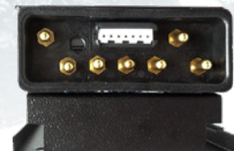
PM-2L-C21 Rear View