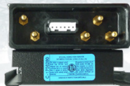
PM-2L-SV Rear View